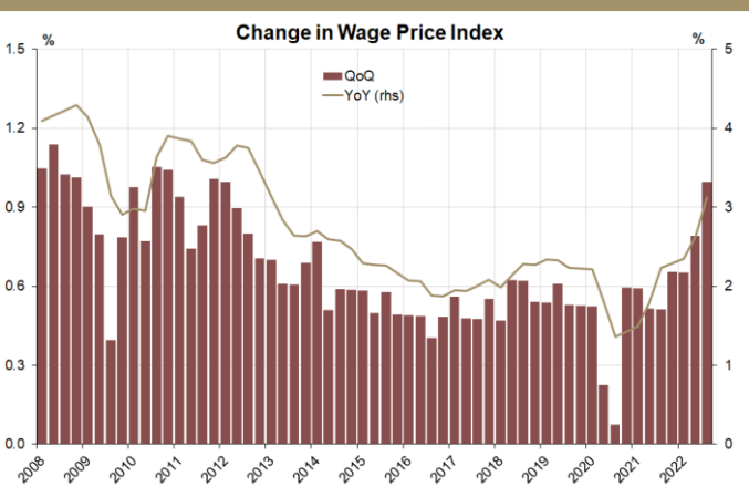
Contributions to Quarterly Change in the Wage Price Index